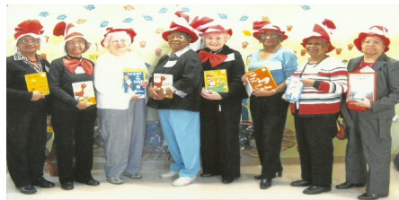
SRTA Readers at Suffolk Head Start